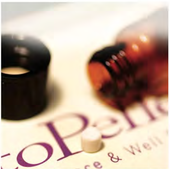
Not all hormones are alike. Natural, plant-based BHRT pellets slipped easily under the skin serve as a 24-7 delivery system with precision dosing to restore the body's normal physiology without synthetic hormone chemicals.